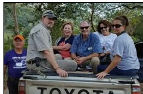
Honduras Medical Mission 2017